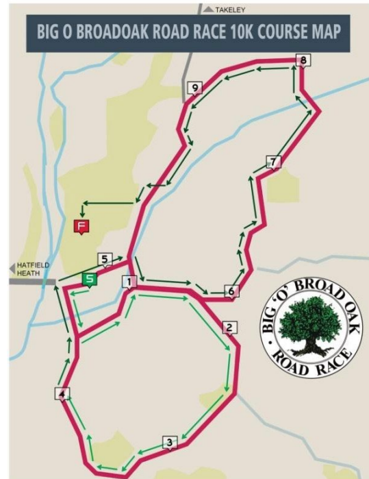
Two large loops with the start in Hatfield Broad Oak High Street, near the entrance to the Church, and the finish on the village green. All roads on the course are closed to traffic and the runners will have the full width of the roads.